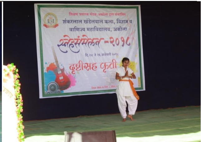
Theme for the year – Action with Vision