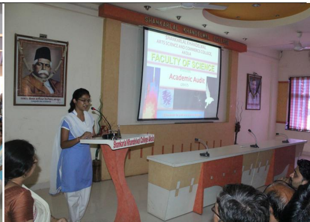
Feedback by student