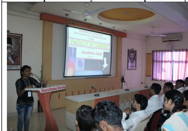
Feedback by student