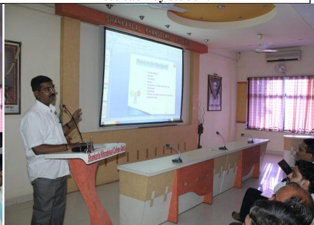
Remark by Principal